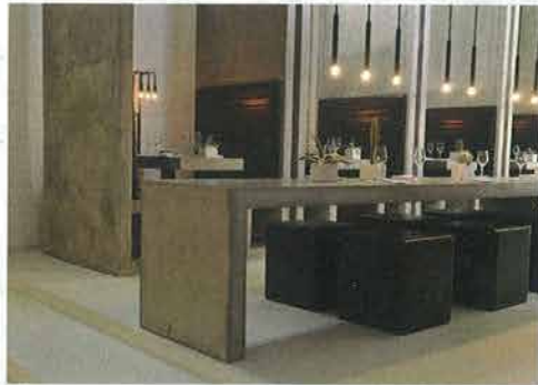
CLOCKWISE FROM TOP Workshop offers a variety of seating arrangements; the project works with, not against, the verticality of the building with maneuvers such as the tall concrete booths; the lighting, designed by PS-Lab in Beirut, complements the Brutalist interior.