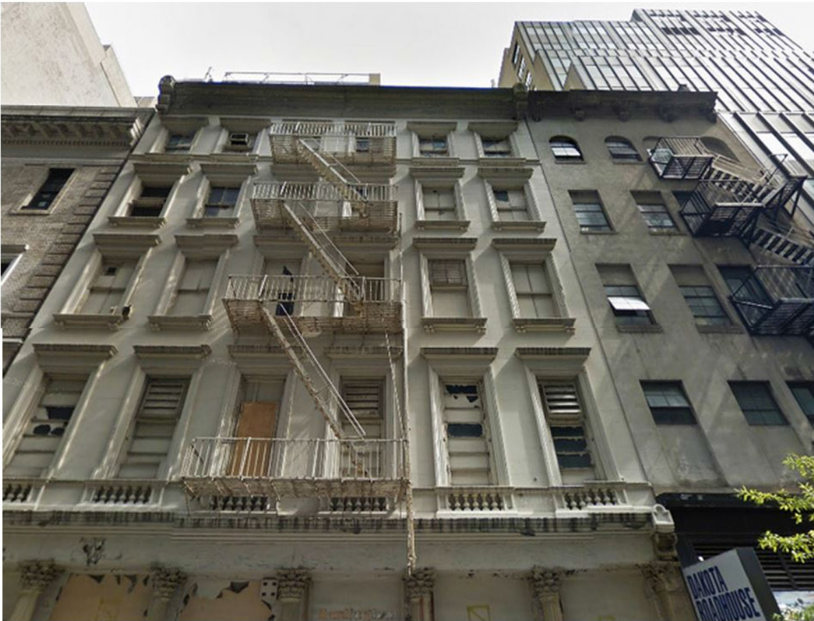
45 Park Place -- via Google Maps

BY: NIKOLAI FEDAK 11:30 AM ON MAY 19, 2014