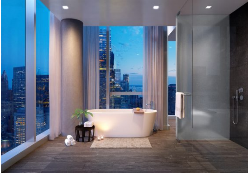
45 Park Place