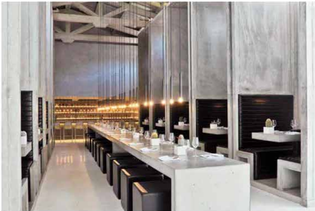
The dining area at the new Workshop Kitchen + Bar.

WHERE TO STAY: The range of accommodations grows wider by the year, but the standard-bearers of local style are still the Parker Palm Springs , with its trademark kitschy-cool interiors by designer Jonathan Adler , and the Colony Palms Hotel , featuring spaces conceived by AD100 decorator Martyn Lawrence Bullard . The budget-conscious would be hard-pressed to find rooms more cheerful than the candy-color ones at the recently debuted Saguaro .