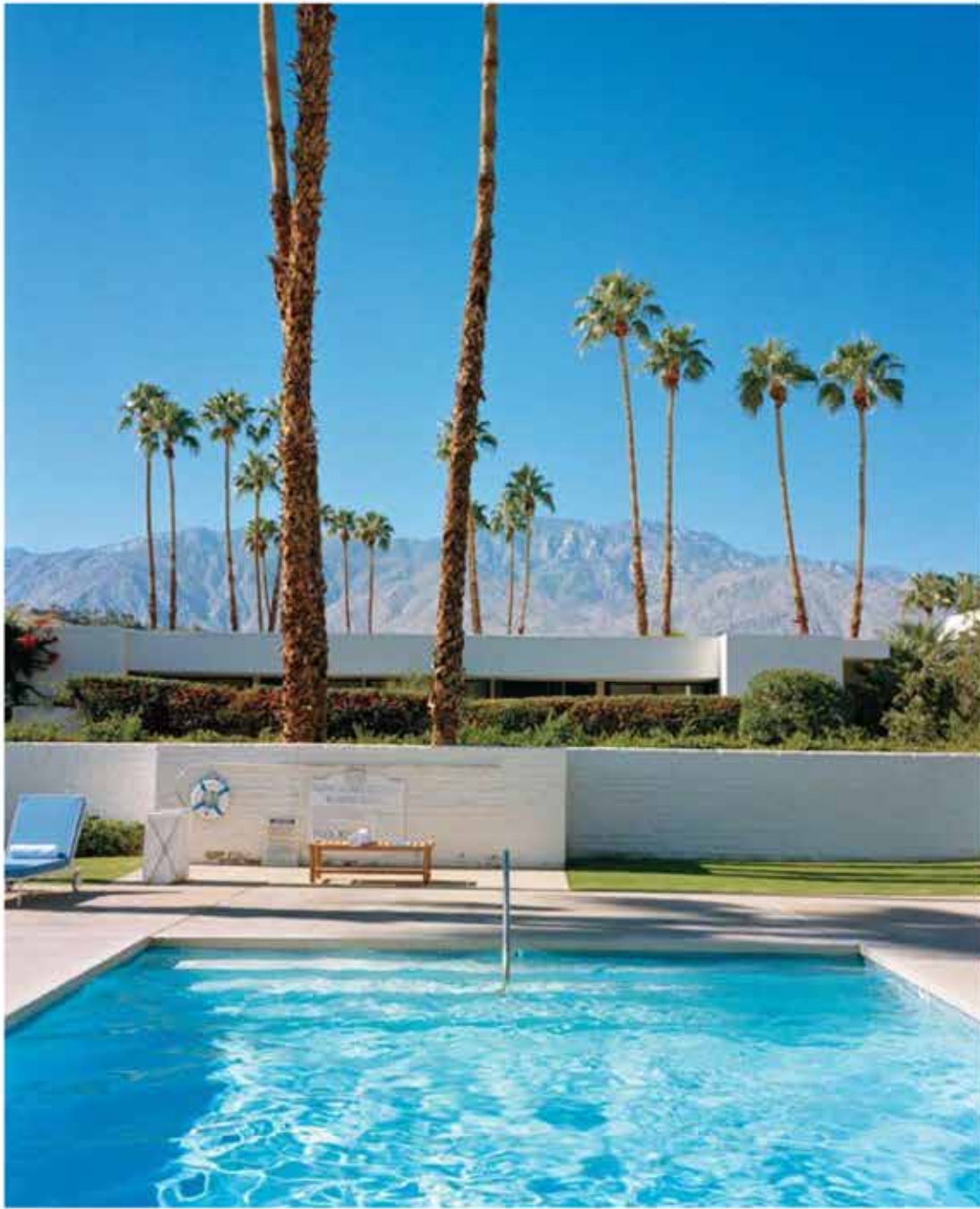
The pool at the Parker Palm Springs.