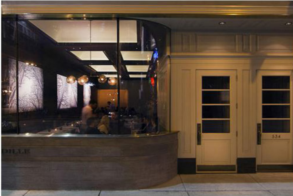
Brindille exterior; Photo © Bureau of Architecture and Design