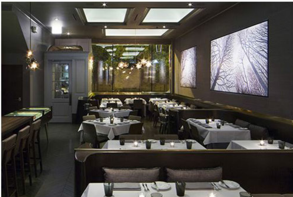
Brindille interior